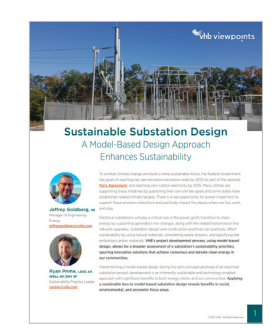
Read Sustainable Substation Design: A Model-Based Design Approach Enhances Sustainability