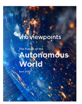
<u>Read E-book:</u> The Future of the Autonomous World

Keeping up with technological advancements and integrating innovation into design and construction continues as a key theme and significant challenge and opportunity for CX participants. Innovations in technology, including automation, are already impacting how we live, work, and play . From self-driving vehicles, to telemedicine, to drone delivery, the benefits of autonomy are boundless and will change life in ways that few have imagined.