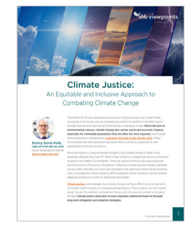
Read Climate Justice: An Equitable and Inclusive Approach to Combating Climate Change