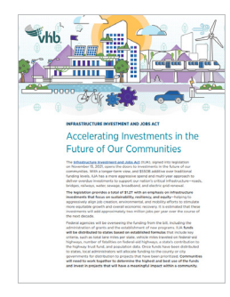
Read Fact Sheet: Infrastructure Investment & Jobs Act

The uncertainty of overall market conditions was also top of mind. Supply chain issues have led to materials shortages, inflation/increased costs of materials, and a potential influx of funding for infrastructure projects, leaving many wondering how they will be able to complete projects on time or be competitive when providing estimates that reflect the marketplace. "The rapid growth of funding for transportation will need immediate support from the AEC industry, with limited resources." The recent passing of the Infrastructure Investment and Jobs Act is a significant opportunity for the AEC industry, with a push towards aggressive spending and a multi-year approach to deliver overdue investments to support our nation's critical infrastructure. This should set a strong foundation for project and economic growth, but some worry that they may be limited in the number of projects they can advance due to material costs, continued delays, and labor shortages.