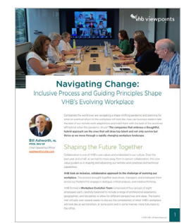
Read Navigating Change: Inclusive Process and Guiding Principles Shape VHB's Evolving Workplace

The "Great Resignation" has impacted almost all industries over the past year plus, including our own. This widespread trend of large numbers of workers leaving their jobs during the COVID-19 pandemic is thought to be the result of many different factors, but most notably dissatisfaction and stress with current working conditions during the pandemic and/or career and lifestyle reassessments. Our CX respondents cited a challenge of "obtaining, retaining, and even increasing the number of workforce talent needed to continue to deliver the immense amount of projects in front of us, particularly with an anticipated increase of infrastructure jobs stemming from the IIJA (see next page). Not having a workforce to deliver will hamper the industry." Lack of skilled staff and/or high turnover within companies will affect the ability to complete work, particularly given an anticipated increase in federally supported and funded projects, which was of particular concern to CX participants.